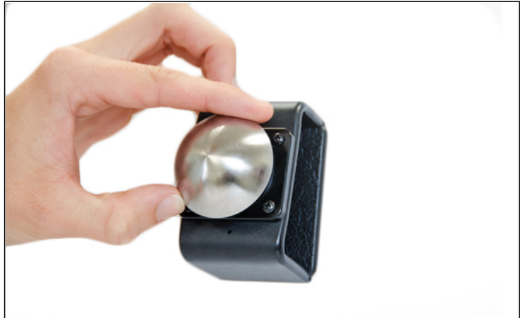
2. Screw the partial sphere onto the base and hand tighten.