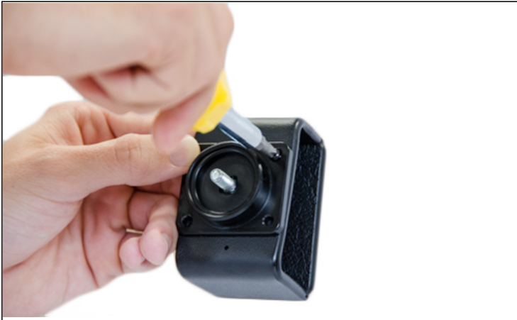
1. Align the iOauto Pro plate holes with the pre-drilled holes in the ProClip vehicle mount and attach using the included screws.

Do not attach anything to the mount face plate until after installing the mount to the dashboard. Doing so makes it more difficult to install the mount to the dash and non-refundable since you have screwed into it. First, attach the ProClip vehicle mount to your vehicle. Follow the installation instruction that have been included with your ProClip vehicle mount.