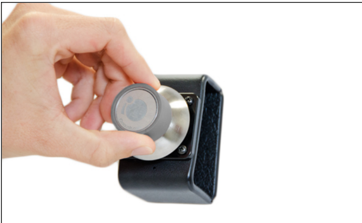
3. Place the iOcore onto the iOauto Pro partial sphere.