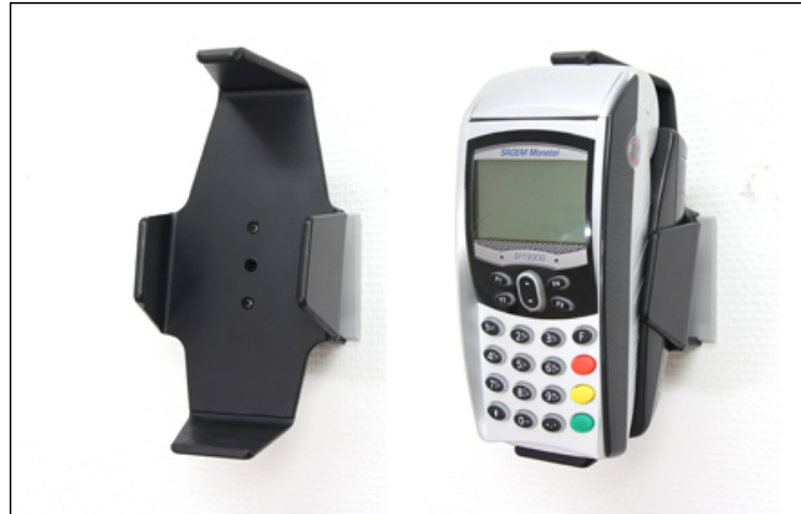
4. The holder in place.