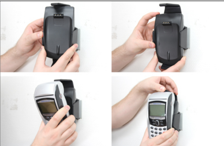
3. Place the charging unit into the holder by carefully expanding the edges of the holder while sliding the charging unit into the holder in a downward motion. To place the device in the holder: Place the bottom part of the device into the holder. Press the top of the device forward into place in the holder. To remove the device from the holder: Press the upper part of the holder forward. When the device is set free, lift it upward out of the holder.

Place the holder onto the base plate. Screw the center screw into the base plate and tighten the screw firmly. Then loosen the screw slightly for easier angling/rotation of the holder.