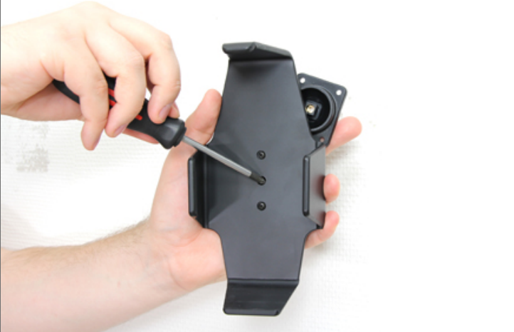
1. Unscrew the screw in the center of the holder and remove the holder from the Tilt Swivel base plate.

Carefully read all instructions and review the images before installing this product.