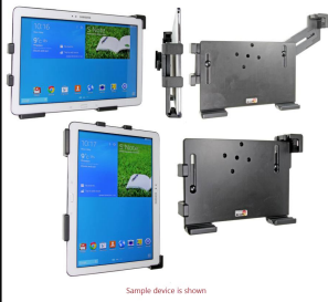
Sample device is shown