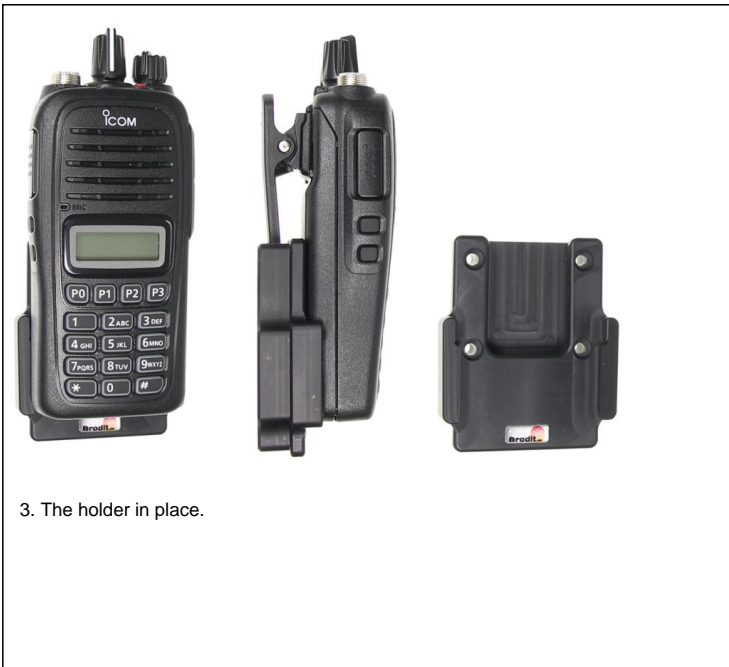
3. The holder in place.