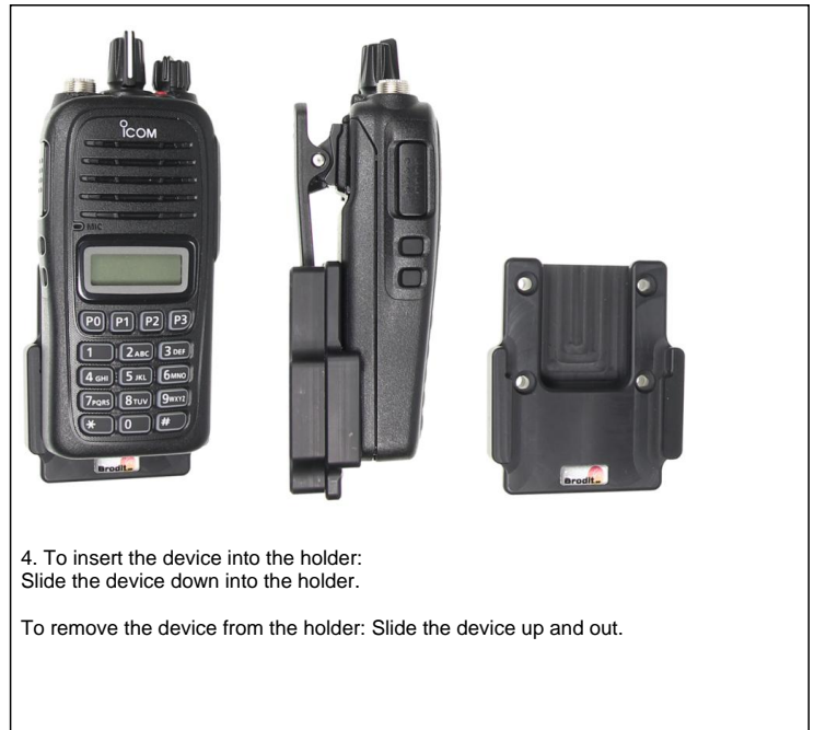
4. To insert the device into the holder: Slide the device down into the holder.

To remove the device from the holder: Slide the device up and out.