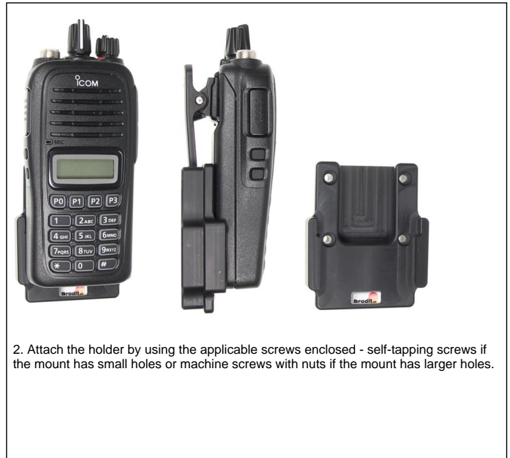
2. Attach the holder by using the applicable screws enclosed - self-tapping screws if the mount has small holes or machine screws with nuts if the mount has larger holes.