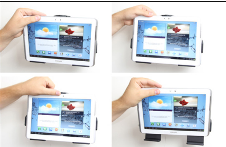
3. To place the device in the holder: Place the lower part of the device in the holder, then flip/press the upper part forwards so it snaps into place in the holder. To remove the device from the holder: Press upwards on the upper part of the holder, in the same time pull the upper part of the device out from the holder and then lift the device up and out from the holder.