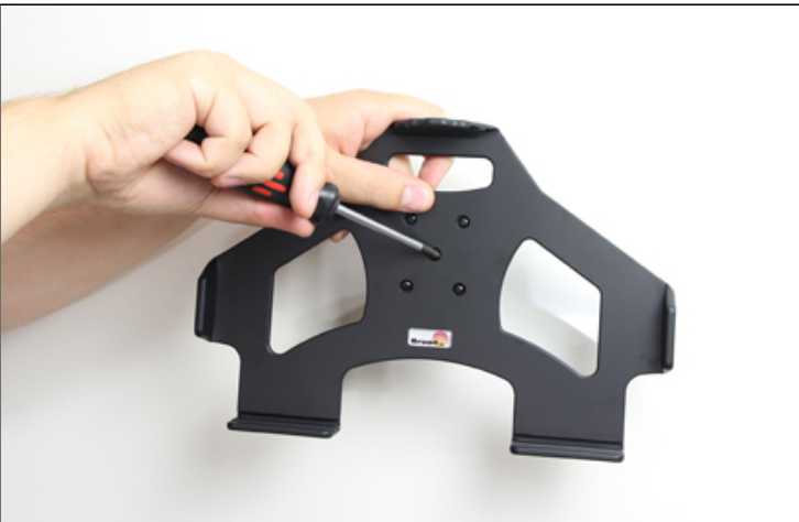
1. Unscrew the screw in the center of the holder and remove the holder from the Tilt Swivel base plate.

Carefully read all instructions and review the images before installing this product.