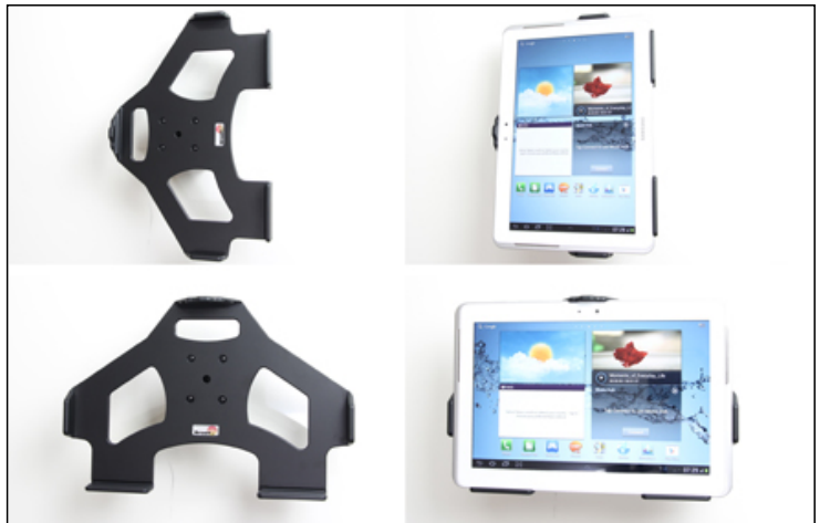
4. The holder is in place.