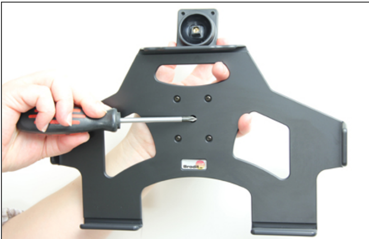
1. Unscrew the screw in the center of the holder and remove the holder from the Tilt Swivel base plate.

Carefully read all instructions and review the images before installing this product.