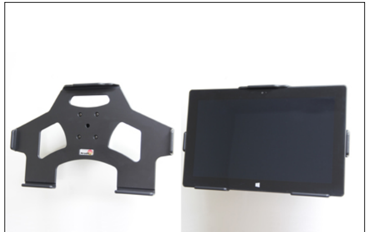
4. The holder is in place. The holder can be rotated and angled to make it work best for you.