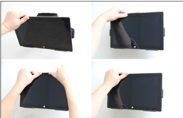
3. To place the device in the holder: Place the lower part of the device in the holder, then flip/press the upper part forwards so it snaps into place in the holder. To remove the device from the holder: Press upwards on the upper part of the holder, in the same time pull the upper part of the device out from the holder and then lift the device up and out from the holder.