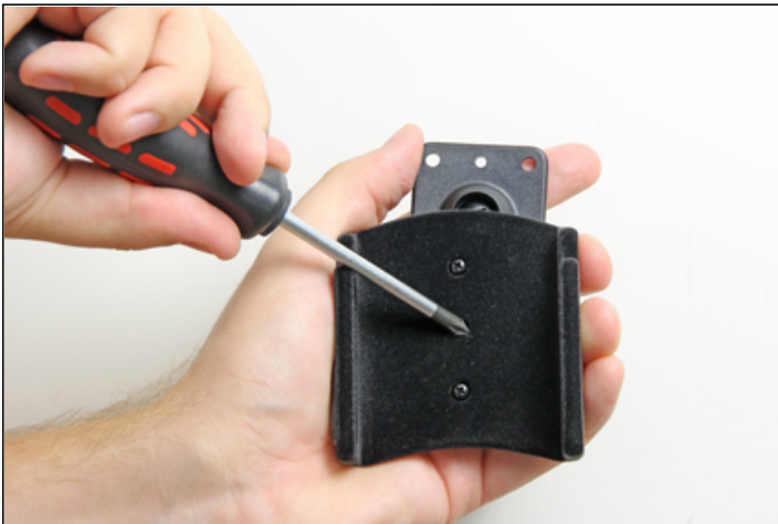
1. Unscrew the screw in the center of the holder and remove the holder from the Tilt Swivel base plate.

To view an installation video, visit this link: https://www.youtube.com/watch?v=rbuLjzjML8&feature=youtu.be