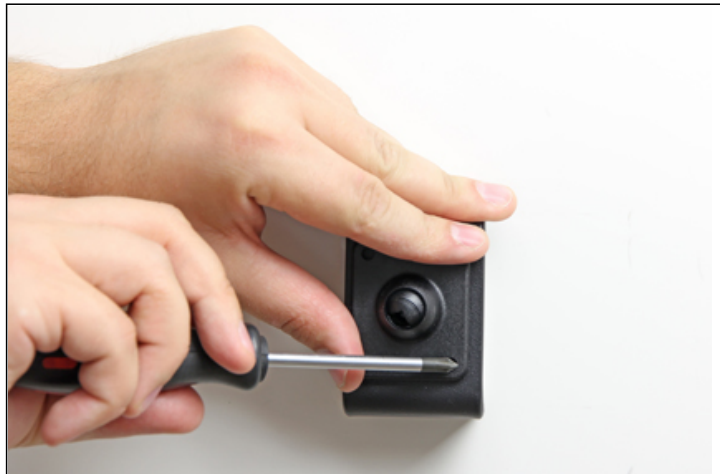
2. Place the base plate over the matching holes in your mounting bracket (demo ProClip mount shown in picture) Attach the base plate by using the self-tapping screws.