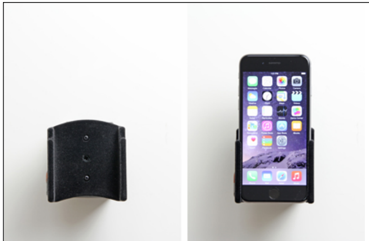
4. Slide the device into the holder. To remove the device from the holder, slide it out.