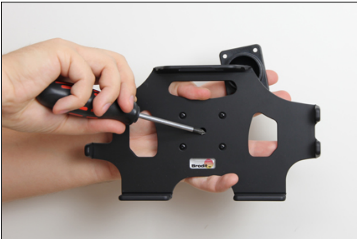
1. Unscrew the screw in the center of the holder and remove the holder from the Tilt Swivel base plate.

Carefully read all instructions and review the images before installing this product.