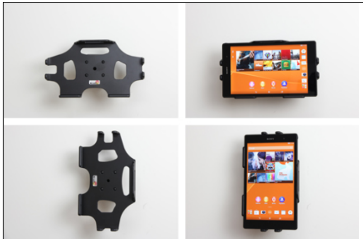
4. The holder is in place.