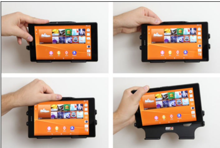
3. To place the device in the holder: Place the lower part of the device in the holder, then flip/press the upper part forwards so it snaps into place in the holder. To remove the device from the holder: Press upwards on the upper part of the holder, in the same time pull the upper part of the device out from the holder and then lift the device up and out from the holder.