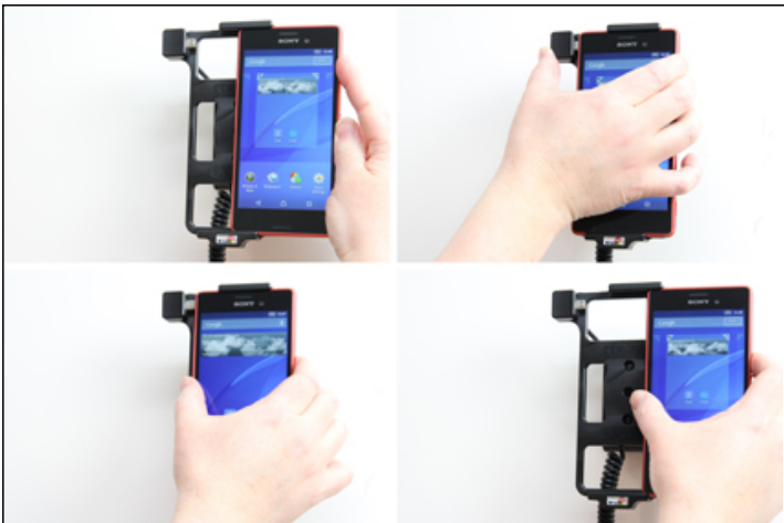
3. Slide the device into the holder on to the connector. To remove the device from the holder, slide it out. .