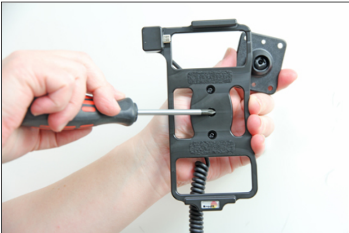
1. Unscrew the screw in the center of the holder and remove the holder from the Tilt Swivel base plate.

Carefully read all instructions and review the images before installing this product.