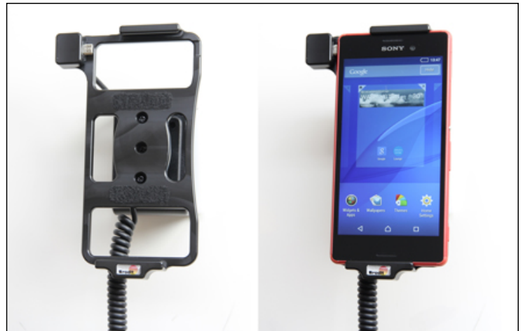
4. The device is in place.