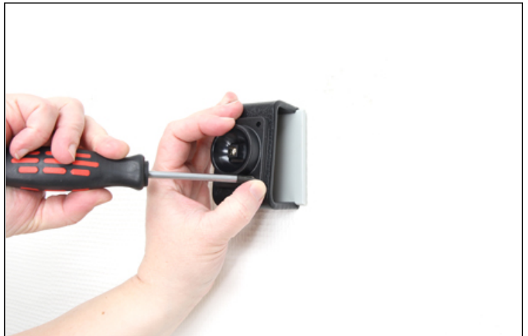
2. Place the base plate over the matching holes in your mounting bracket (demo ProClip mount shown in picture) Attach the base plate by using the self-tapping screws. Note: The machine screws with nuts are for mounts made of metal with large holes.