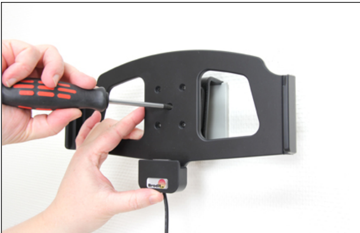
3. Place the holder onto the tilt swivel base plate and reattach it with the center screw. The center screw also controls the pivot, tighter for a firm hold and loose for easier rotation/angling of the Holder.