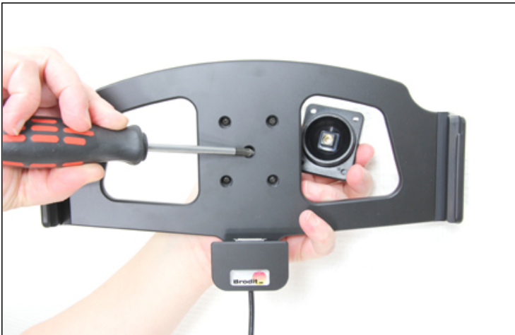
1. Unscrew the screw in the center of the holder and remove the holder from the Tilt Swivel base plate.