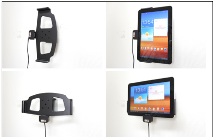
4. Slide the device into the holder. To remove the device from the holder, slide it out. For wiring and connecting to a power source, please follow the diagram further up on this page.