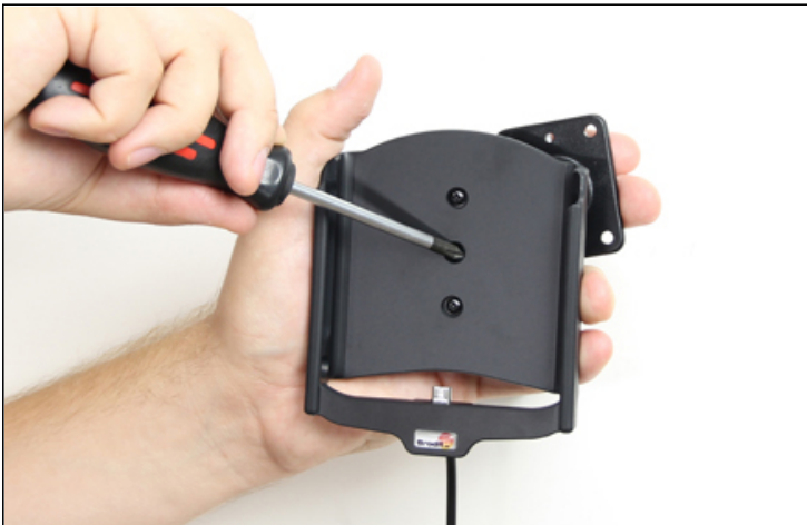
1. Unscrew the screw in the center of the holder and remove the holder from the Tilt Swivel base plate.