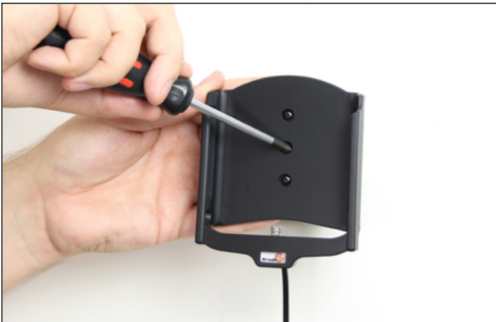
3. Place the holder onto the tilt swivel base plate and reattach it with the center screw. The center screw also controls the pivot, tighter for a firm hold and loose for easier rotation/angling of the Holder.