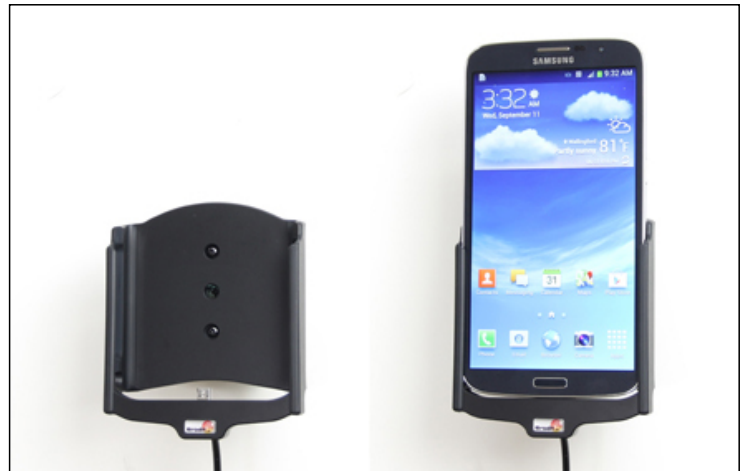
4. Slide the device into the holder. To remove the device from the holder, slide it out. For wiring and connecting to a power source, please follow the diagram further up on this page.