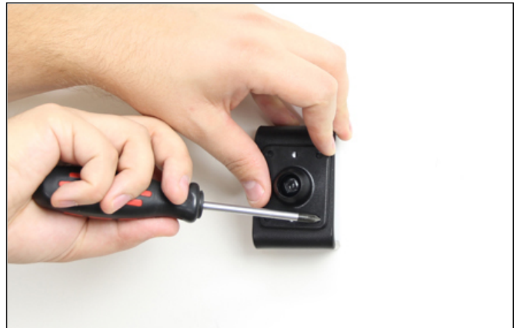
2. Place the base plate over the matching holes in your mounting bracket (demo ProClip mount shown in picture) Attach the base plate by using the self-tapping screws. Note: The machine screws with nuts are for mounts made of metal with large holes.