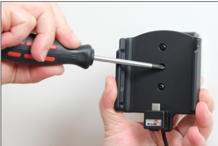
3. Place the holder onto the tilt swivel base plate and reattach it with the center screw. The center screw also controls the pivot, tighter for a firm hold and loose for easier rotation/angling of the Holder.