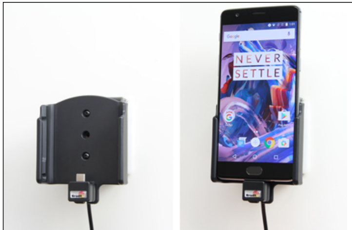
4. Slide the device into the holder. To remove the device from the holder, slide it out. For wiring and connecting to a power source, please follow the diagram further up on this page.