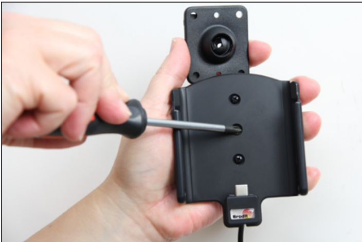
1. Unscrew the screw in the center of the holder and remove the holder from the Tilt Swivel base plate.