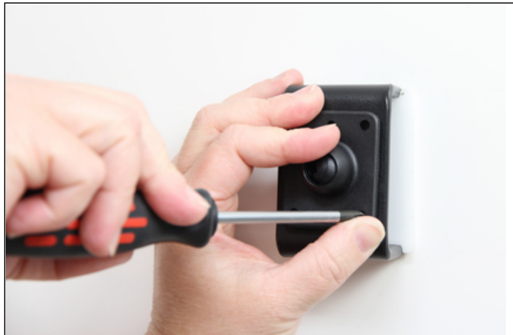
2. Place the base plate over the matching holes in your mounting bracket (demo ProClip mount shown in picture) Attach the base plate by using the self-tapping screws. Note: The machine screws with nuts are for mounts made of metal with large holes.