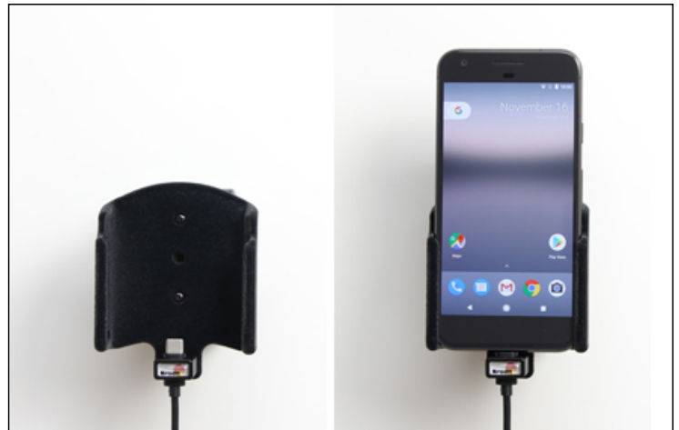
4. Slide the device into the holder. To remove the device from the holder, slide it out. For wiring and connecting to a power source, please follow the diagram further up on this page.