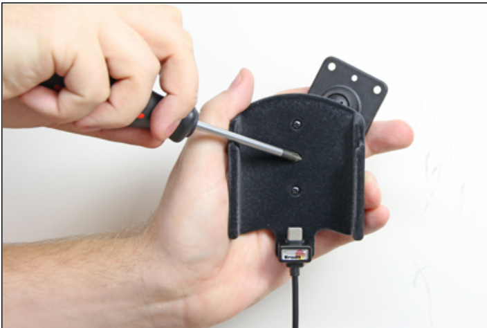
1. Unscrew the screw in the center of the holder and remove the holder from the Tilt Swivel base plate.