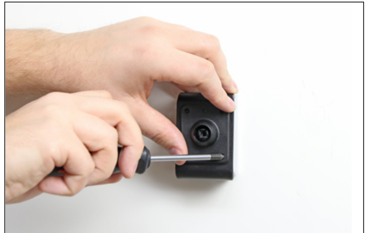
2. Place the base plate over the matching holes in your mounting bracket (demo ProClip mount shown in picture) Attach the base plate by using the self-tapping screws. Note: The machine screws with nuts are for mounts made of metal with large holes.