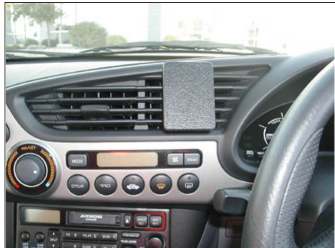
4. The ProClip Mount is in place.