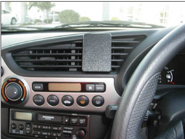
3. The ProClip is now in place as shown in the overview picture.