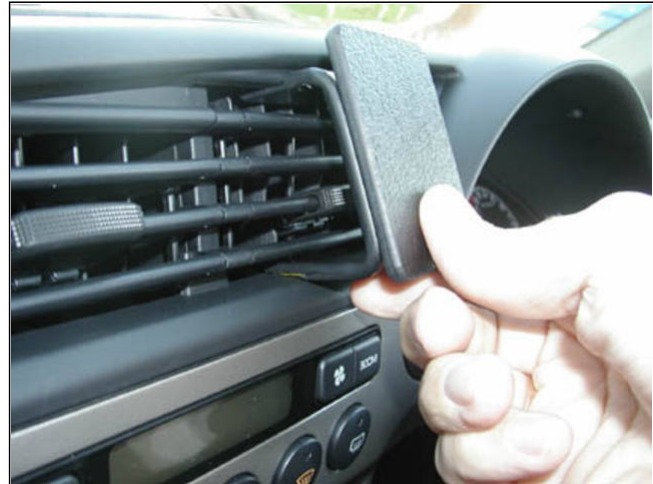
2. Press the lower part of the ProClip upwards and forward so the part with the adhesive tape attaches to the air vent ledge.